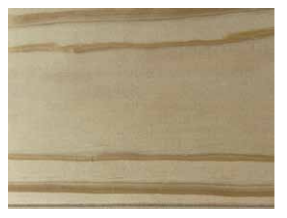
Southern Yellow Pine