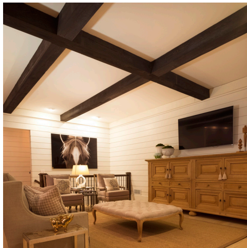
Rustic Interior Cypress Beams