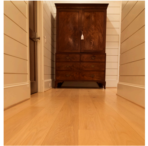
Wide-Plank White Oak Flooring