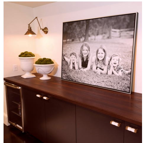
Thermally Modified Ash Countertop