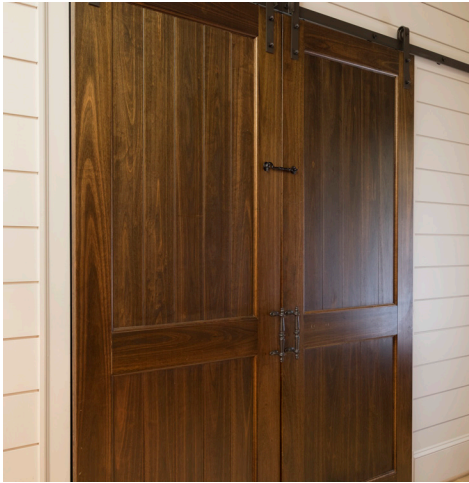
Red Grandis Interior Barn Doors