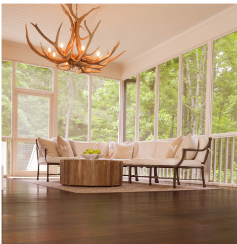
Thermally Modified Deck