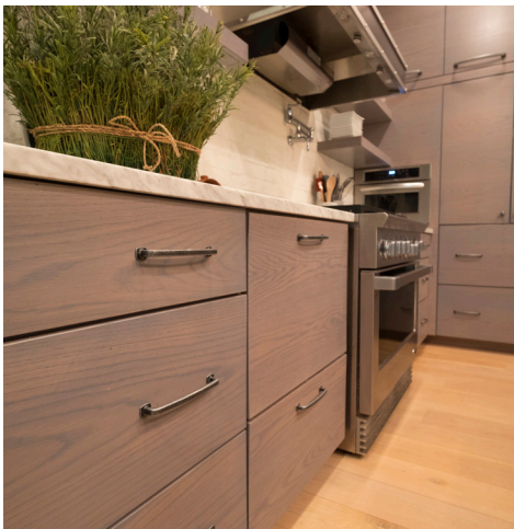
Sequence-matched White Oak