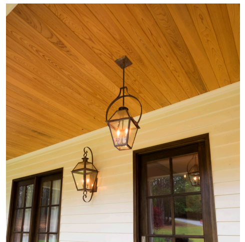
Cypress Exterior Porch Ceiling