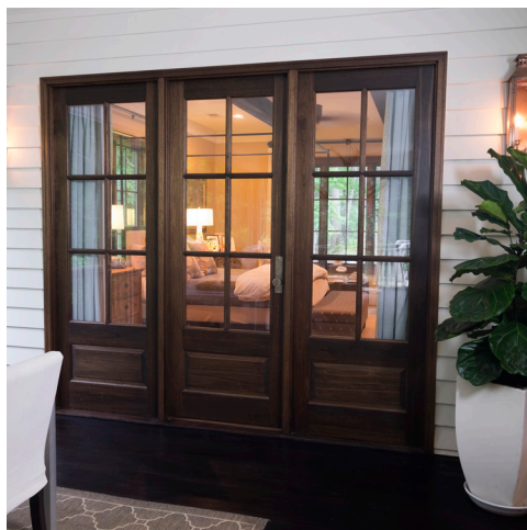
Red Grandis Exterior Doors