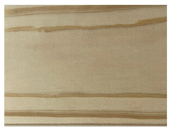
Southern Yellow Pine